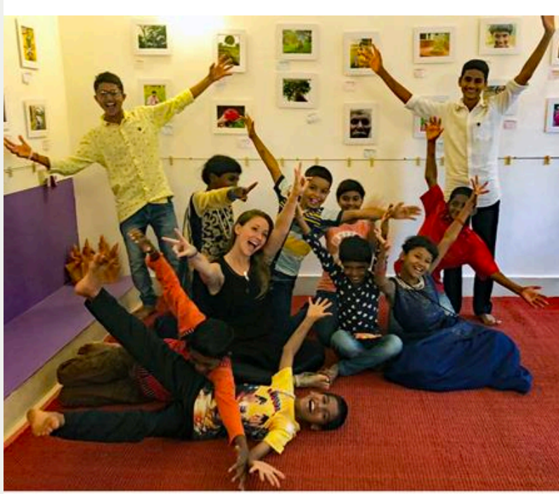
At the end of the photography classes, each child got to present his or her best photograph at an exhibit showcasing their talent!