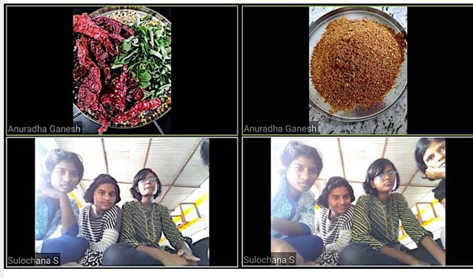
learning how to make sambar (curry) powder

Watch the virtual cooking class with Anu Aunty and some of our girls on how to make sambar (curry) and give it a try in your kitchen!